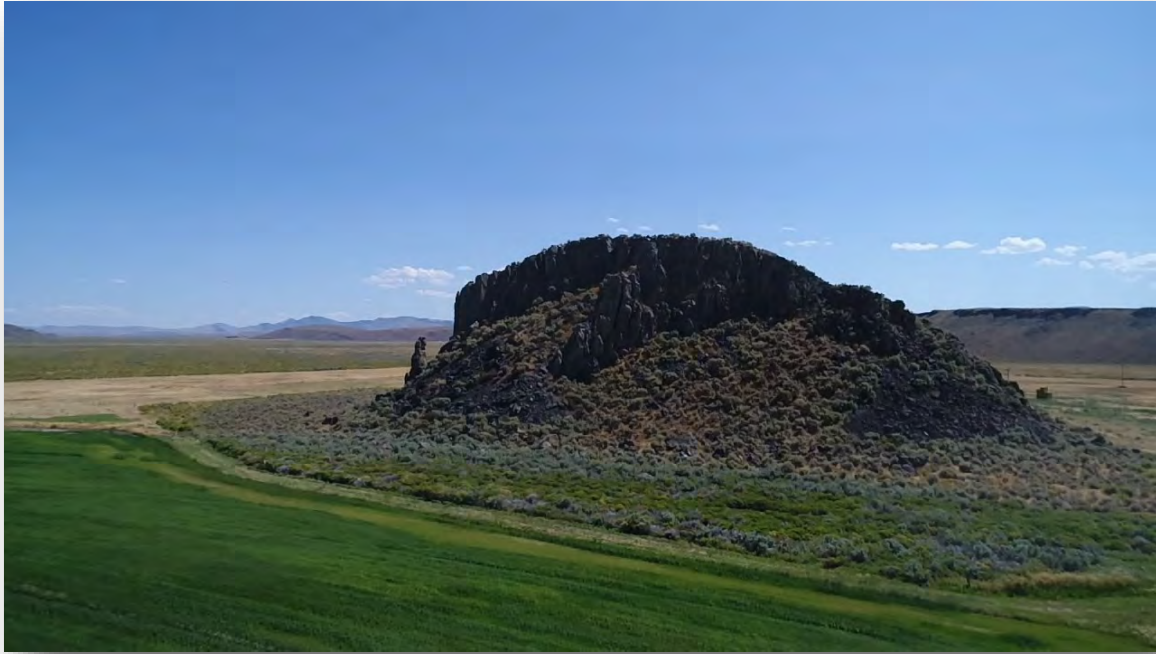
INDIAN HEAD BUTTE